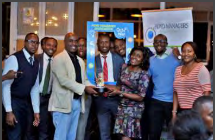
WINNER - Genghis Capital