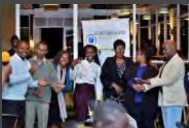
2nd runners up - Fusion Capital