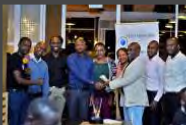
1st runners up -Old Mutual